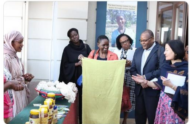
ሥራ እና ክህሎት ሚኒስቴር / Ministry of Labor and Skills and 6 others