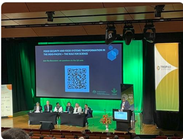
9:25 AM · Nov 1, 2022 · Twitter for iPhone

“I cannot imagine anything more agonizing than food insecurity. Food insecurity is not a problem of Africa. It is a global problem. Hidden hunger exists in the US, in Europe, in Australia. Transformation of our food systems is No.1 priority. “ - Segenet Kelemu @icipe #TropAg2022