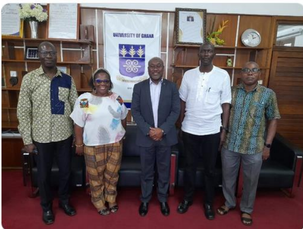
1:48 PM · Nov 1, 2022 · Twitter Web App