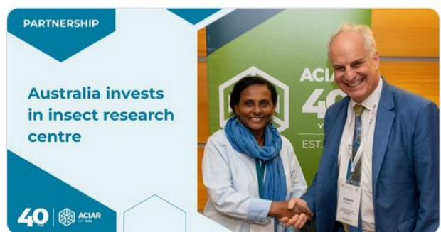
6:49 AM · Nov 2, 2022 · Sprout Social