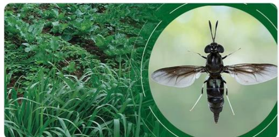
Nation Africa and 9 others

@IKEAFoundation partners with @icipe to harness two of the Centre's successful innovations: vegetable integrated #pushpulltechnology and #blacksoldierfly farming into a One Health approach. Read more: icipe.org/news/ikea-foun... @TheAfricaReport @SciDevNetSSA @MeshaScience