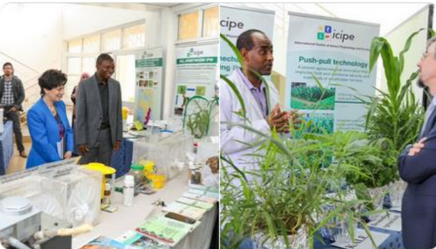
1:58 PM · May 9, 2024 · 608 Views