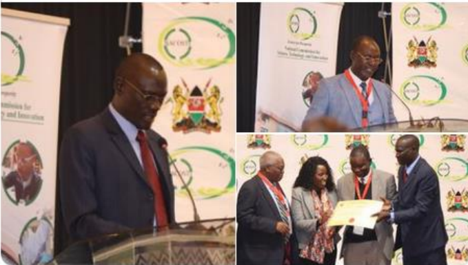
1:56 PM · May 7, 2024 · 225 Views

The Multisectoral Conference on Research, Science, Technology & Innovation #RSTIConference2024 organized by @nacosti & @Kenya_aist is currently underway! We are pleased to participate in this incredible event, exploring the vital role of STI in global prosperity & public good!