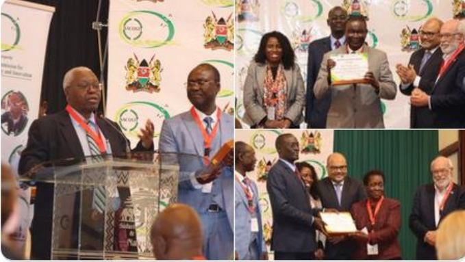
Konza Technopolis Development Authority and 3 others