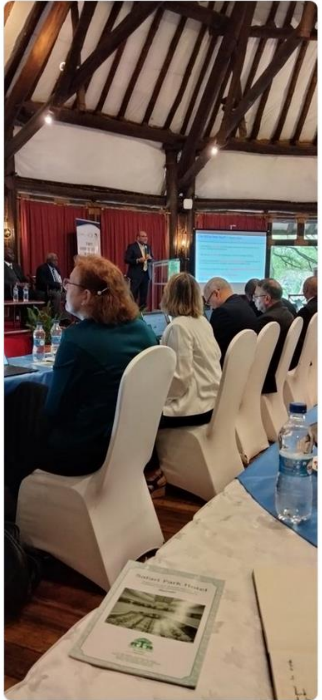
11:21 AM · May 6, 2024 · 44 Views