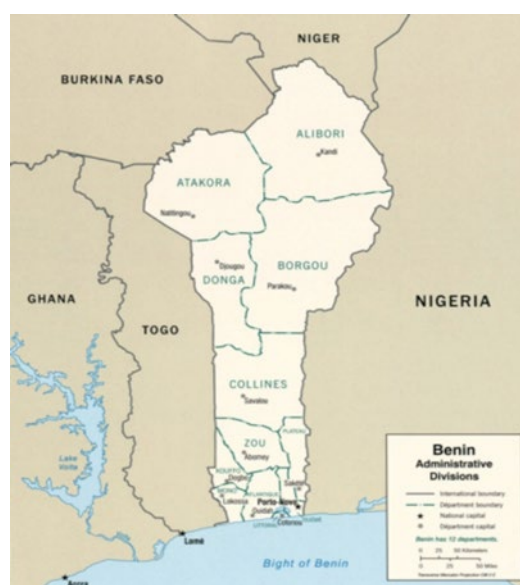
Fig. 1: Geographical location of Benin. Benin is located on the West Coast of Africa

Unreliable PH loss data can deny decision makers the opportunity to optimise their efforts and strategies for preventing PH losses. The International Centre of Insect Physiology and Ecology ( icipe ), with financial support from International Development Research Centre (IDRC) conducted a systematic review of literature for 11 commodities: cowpea, maize, rice, groundnut, tomato, leafy vegetables, mangoes, oranges, cassava, yam and fish, to establish the magnitude of PH losses for these commodities in Benin. A further aim was to unravel the kind of innovations that