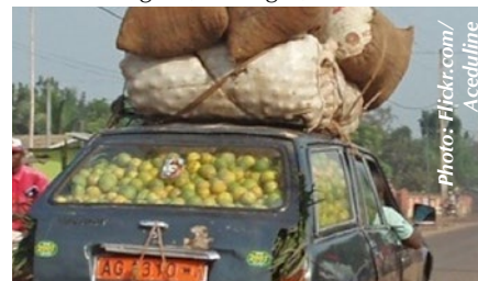
Rough handling hastens deterioration

Fruits and vegetables: Mangoes, oranges, tomatoes and leafy vegetables are important fruits and vegetables produced for subsistence and commercial purposes in Benin. They are marketed mainly in their fresh form in local and regional