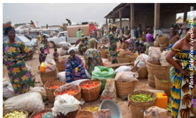
Fresh vegetables at the market

Food markets in many developing countries are undergoing fundamental transitions. Urbanisation and growing middle-class incomes have pushed for new consumer needs, and value chains have evolved to include more and more contribution of value addition activities. There is a growing demand for safe, convenient, nutritious and quality food as well. Thus unlike in the past, strategies for managing PH losses, can no longer concentrate on farm-level activities, ignoring the rest of the PH chain where spatial interactions and value addition are possible.