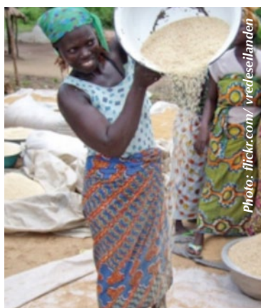
A farmer conducts preliminary processing of rice

influenced by erratic rainfall patterns leading to spatial and temporal supply. At farm level, storage and preservation are poorly managed by the average farmer. Traditional granaries are still popular among farmers. Several technologies to mitigate losses such as use of resistant varieties, improved wooden granaries, clay granaries, hermetic storage, biological control and the application of chemical protectants and botanicals were promoted in earlier interventions.