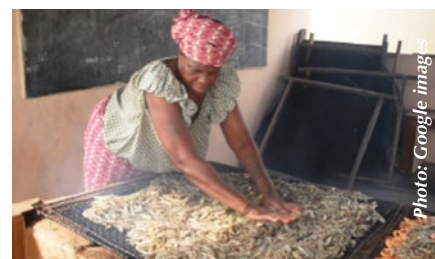
A fish dealer smoking shrimp

Fish: About 25% of the active population in Benin is engaged in fishing. Inland fishing contributes about