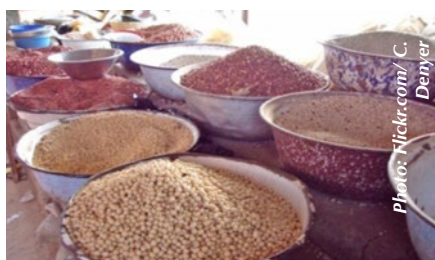
Cowpea grains at the market

Pulses: Cowpea is the most cultivated and consumed legume in Benin. It is produced in four agroecological zones, with Forest Mosaic, Southern Guinea and Northern Guinea Savanna accounting for