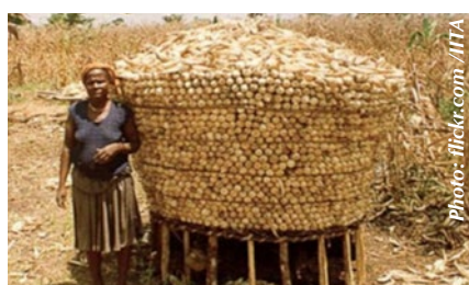
Maize storage barn

Cereals: Maize and rice are the most important cereals in Benin. Maize accounts for 70% of the total cereal production. Production differs depending on the local consumption patterns and comparative advantages of other crops. Producers in northern Benin cultivate maize for commercial purposes while maize is a staple food crop in southern Benin. Maize supply is in-