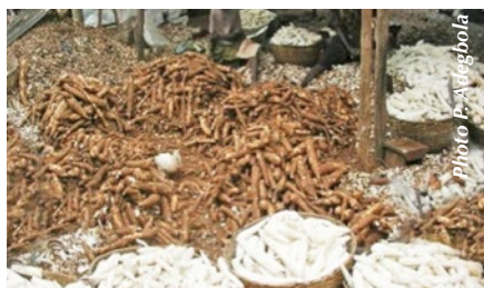
Cassava at a processing centre

Root and tuber crops: Yam and cassava are important food crops in Benin. Over 80% of cassava production takes place in southern Benin and is dominated by small-scale farmers. Cassava is utilised while fresh, but 70% is processed into dried chips and gari. Cassava processing is predominantly undertaken by women, and by small and middle enterprises. Hermetic storage has been efficient in protecting cassava against storage insect pests.