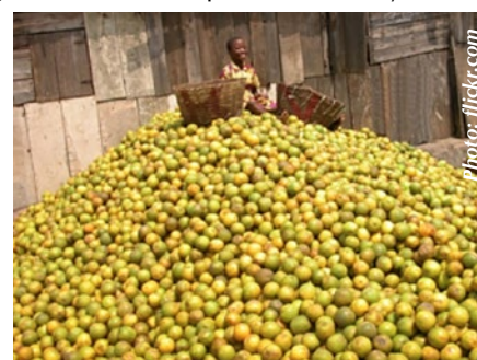
Losses arise from lack of markets and alternative means of preservation

Horticultural crops: Fruits and vegetables are predominantly marketed in the fresh form. Main value addition activities are basic operations that include washing, sorting, grading, bulking, and sprinkling with cold water. Handling of produce is often rough, and hastens deterioration. Routinely, due to market glut, retailers have to dispose of produce that remains unsold at close of market day at low prices or simply abandon it. At smallholder level, processing is minimal, and product recovery rates as well as quality are major constraints. Other constraints include lack of permanent market outlets, price fluctuations and poor distribution systems. A number of private firms produce in bulk for the export market. For the local market, most farmers lack knowledge and skills of simple shelf-life enhancing practices. Handling infrastructure and technical capacity for surplus produce preservation are inadequate.