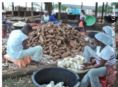
A group engages in cassava processing

Without value addition, economic value of products is low, and so also, is the incentive to invest in PH technologies. Strengthening partnerships among farmers into SMEs helps them to take