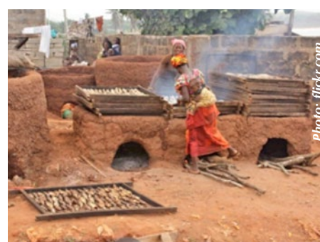
The Chorkor oven drastically improved fish preservation

Fish: About 60% of animal protein needs in Ghana is satisfied through fish. Annual per capita consumption of fish is estimated at 23 kg, much higher than the global average of 13 kg. The marine sector contributes about 74% to the national catch, whereas inland fishing and aquaculture contribute 22 and 4%, respectively. Inadequate storage facilities are a key constraint. Losses are mainly due to handling inefficiencies during transportation and storage. A common local method for fish preservation is smoking. The introduction and successful adoption of the Chorkor oven, drastically improved fish preservation by smoking as it is economical on fuel, can smoke huge quantities of fish and can be set using local materials.