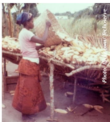
On-farm maize storage in outdoor platforms

Leading producer zones of maize are Brong-Ahafo, Eastern and Ashanti regions. Farmers sell about 60–75% of maize after harvest, thus only 25–40% is stored at farm level for subsistence or future sale at better prices. At farm level, storage facilities include traditional wood or mud silos and in-house or outdoor platforms.