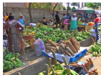
Horticultural produce is mainly marketed in the fresh form

er handling result in deterioration and value loss exceeding 33%. Individual yam producers and traders are resource-poor operators, who cannot afford advanced technologies (such as refrigeration or fungicide application), to slow down deterioration. Cassava, on the other hand, is utilised fresh but substantial amounts are processed into gari , flour, dried chips and starch.