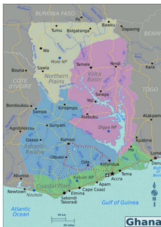
Fig. 1: Geographical location of Ghana. Ghana lies in the centre of the West African coast

Food losses contribute to high food prices by removing part of the food supply from the market. They also impact on environment as land, water, and non-renewable resources such as fertiliser and energy are used to produce, handle, process and transport food that no one consumes. Mitigating PH losses can improve food security by increasing food availability, incomes and nutrition without the need to employ extra production resources. In 2008 the government of Ghana through the Ministry of Food and Agriculture (MOFA), assessed PH losses along value chains of various food commodities, with a view to developing loss reduction policies. The initiative was guided by the realisation that fundamental changes in food systems had taken place over the years, necessitating new baseline data to be made available. Growing urbanisation, for example, has required more produce to be transported over longer distances to non-producing demand areas. Similarly, commodities have to be stored for longer periods to guarantee year-round supplies. Researchers and development agencies have to grapple with the persistent question of what direction PH innovations ought to take, so as to achieve meaningful reduction of PH losses without necessarily having to reinvent the wheel.