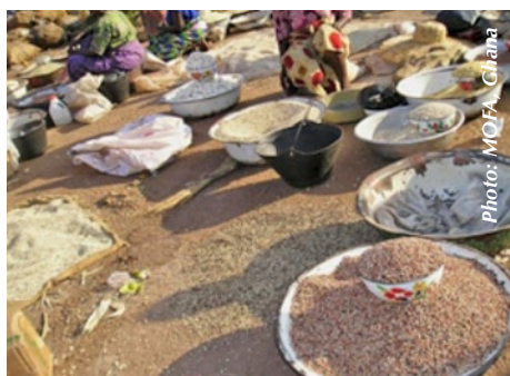
Spillage losses during marketing

Pulses: Cowpea is the most important grain legume in Ghana. Over 90% of production takes place in the northern region and is dominated by small-scale farmers. In the marketing segment of the value chain, some traders purchase and store large quantities