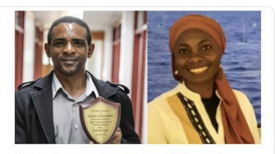
icipe Governing Council Awards 2022