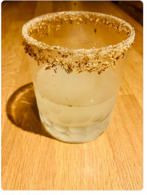
2:52 PM · Jan 29, 2021 · TweetDeck

It's Buzzing day today! I talk about frass (insect manure), with insight from research by Valala Farms (hello @ant_explorer) and @icipe. And I make mealworm margaritas - cheers! Subscribe here buzzing.substack.com/welcome