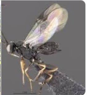
6:11 PM · Jan 27, 2021 · Twitter Web App