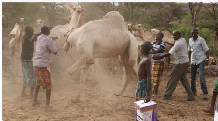
2:50 AM · Jan 29, 2021 · Twitter for iPhone

Blood collection from camels is painful & poses huge risk to the handlers as camels could inflict fatal injury as they can bite or kick. However, the use of biting flies or keds to detect diseases provides an easier, less invasive way for disease surveillance - Dr. Joel Bargul