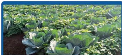
Scaling of Climate Smart Agricultural Technologies in Sub-saharan Africa