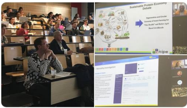
12:28 PM · May 25, 2023 · 258 Views