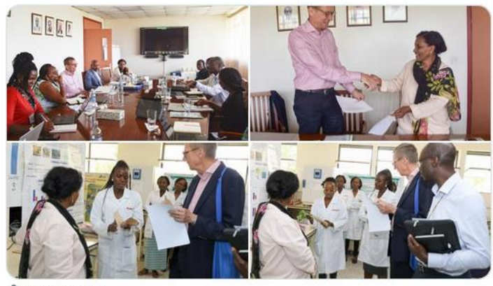
IITA and IFDC

The @BioInnovate Africa implementation progress meeting was successfully held recently with attendance by @Sida representatives & @icipe management, and interacted with newly funded project on using banana fibre technology for efficient crop protection-@NemAfrica. #bioinnovations