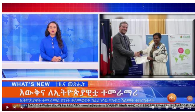
የኢኮኖሚ አማካሪዎች ፋዶዳ እና ሌሎችም መረጃዎች ፣ ማንቦት 18 ,2015 What's New May 26,2023