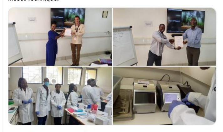
4:24 AM · May 23, 2023 · 46 Views

2/3 The training hosted at International Centre of Insect Physiology and Ecology ICIPE @icipe is one of the activities of the IAEA funded projects on enhancing regional capacity for the Implementation of the Sterile Insect Technique.