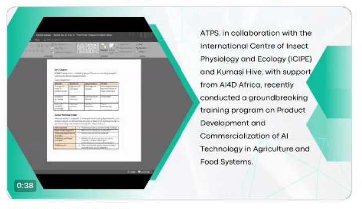
4:28 PM · Sep 19, 2023 · 53 Views

A game-changing moment for African agriculture! ATPS, with ICIPE and Kumasi Hive, backed by AI4D Africa, recently hosted a groundbreaking AI training event for agriculture. Together, we're shaping a tech-driven future for African farming! #AgricultureInnovation #AI4Agriculture