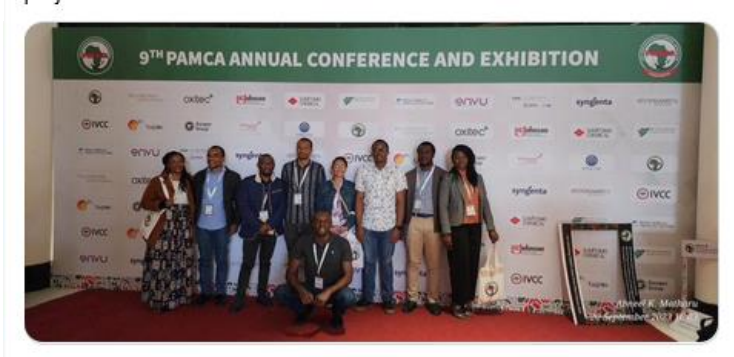
5:35 PM · Sep 20, 2023 from Ethiopia · 88 Views

@icipe - human health theme at #PAMCA2023 presenting interesting research findings from Cattle-Targetted Intergrated Vector Managment, #Tungiasis #NTDs, @Symbio_Vector projects.