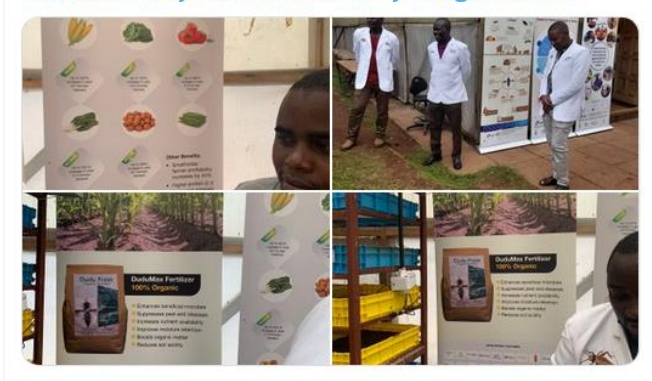
2:04 PM \cdot Nov 14, 2022 \cdot Twitter for Android