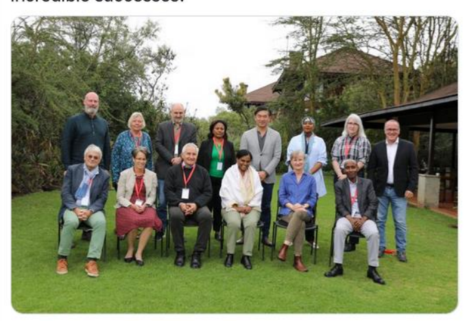
3:16 AM · Nov 18, 2022 · Twitter for Android