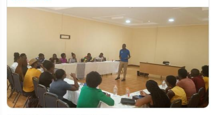
8:45 PM · Nov 15, 2022 · Twitter Web App

@plantvillage is creating job security among #Malawian youths equipped with #tech to help #farmers build climate and food resilience. Now, there is hope! Show this thread