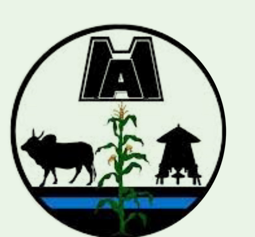
Department of Agricultural Research Services (Malawi)